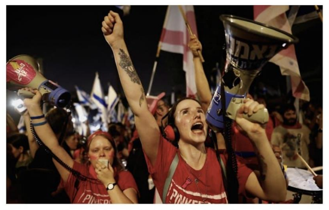
Thousands of people protested in Tel Aviv on Saturday

Ten thousand reserve soldiers have become the latest group to suspend their volunteer duties in protest at the planned overhaul.